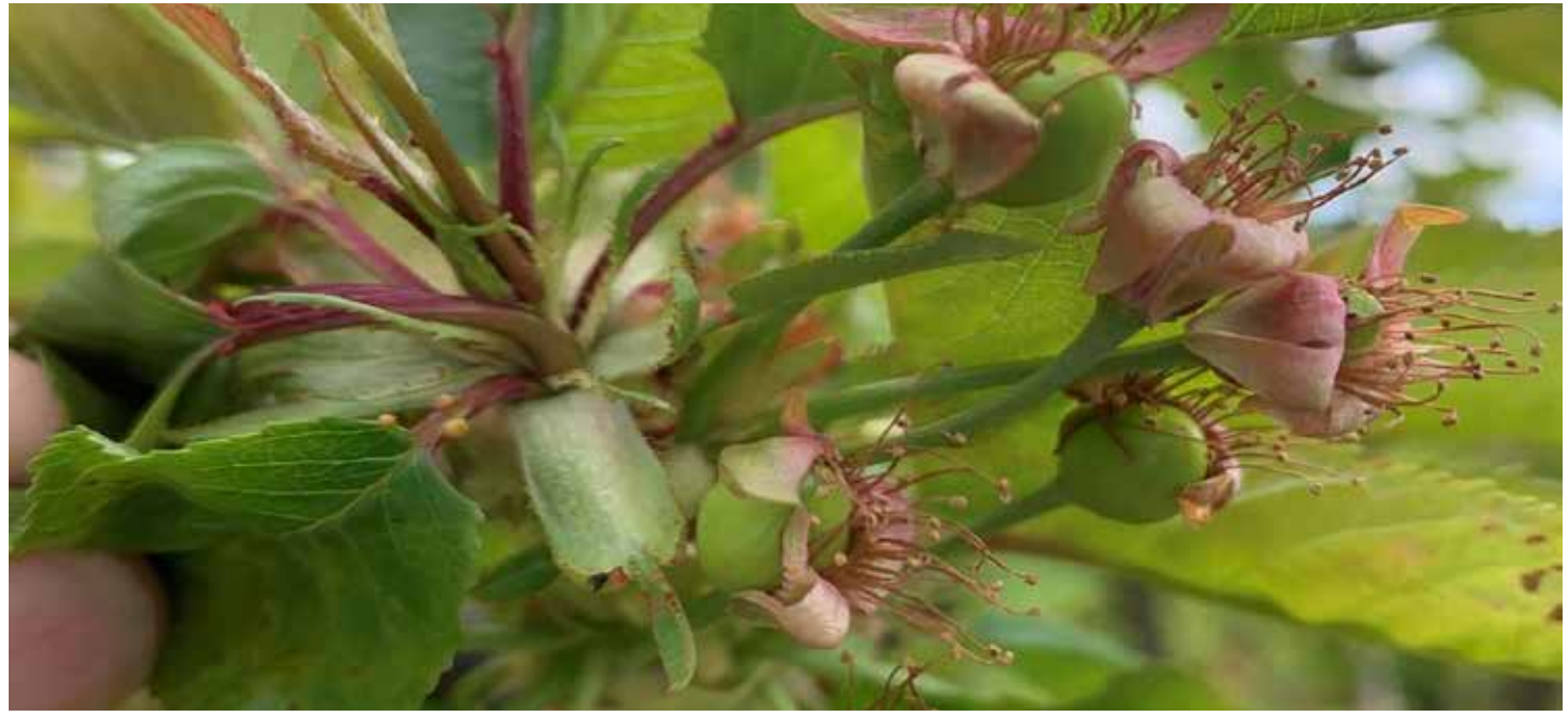
BBCH 72: green ovary surrounded by dying sepal crown, sepals beginning to fall

Use Premio in a program. Begin applications from fruit set onwards, i.e. crop stage BBCH 72: green ovary surrounded by dying sepal crown, sepals beginning to fall. Continue applications at an interval no greater than 10–15 days. Ensure an application is made 14 days prior to harvest. Can be used up to the time of harvest.